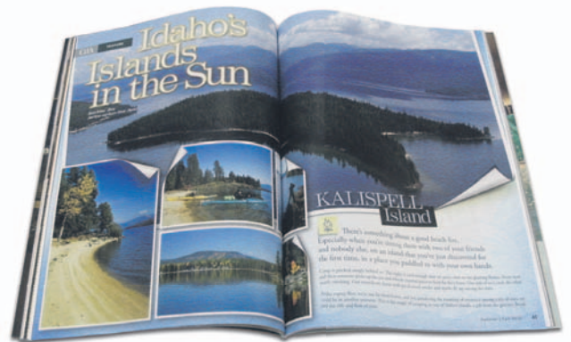
Every issue of CdA Magazine delivers professionally written stories and stunning photography!

CdA Magazine is provided to selected libraries, and professional and business offices across the region. Chambers are allowed to distribute in their relocation packets to attract business and leisure travelers to North Idaho. Advertisers are allowed to distribute to their prospects, a very useful tool to show your presence in the community.